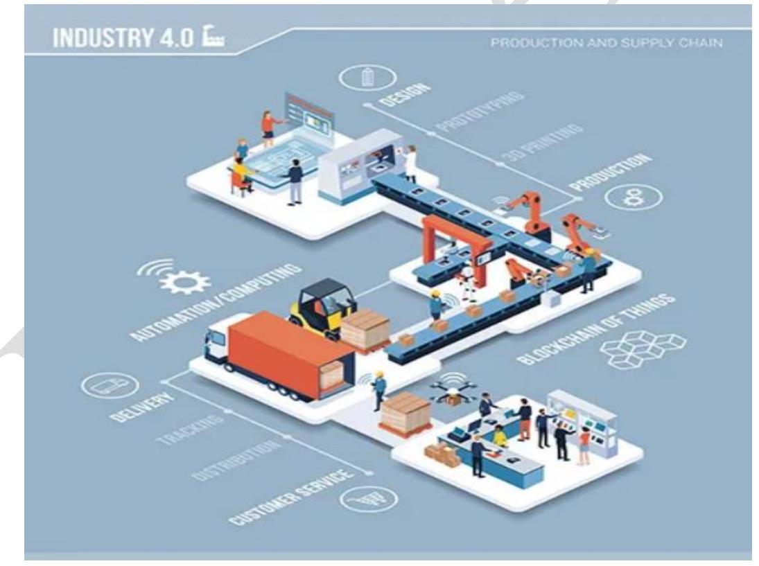
Figure 1 Industry 4.0 diagram

from agrarian to industrial societies. The second industrial revolution, marked by the advent of electricity and assembly lines, revolutionized mass production and spurred rapid urbanization. The third industrial revolution, often referred to as the digital revolution, introduced computers and automation, paving the way for the digital age. Industry 4.0 builds upon these foundations, leveraging the power of digital technologies to drive a new wave of innovation and efficiency in manufacturing. At its heart lies the concept of cyber-physical systems (CPS), wherein physical components are imbued with embedded computing capabilities, enabling them to interact with their environment autonomously. These CPS form the backbone of smart factories, where interconnected machines, devices, and processes collaborate seamlessly to optimize production and enhance quality. The genesis of Industry 4.0 can also be attributed to the rapid proliferation of digital technologies and the exponential growth of data. With the advent of the Internet and the rise of connected devices, the world has become increasingly interconnected, giving rise to what is often referred to as the "Internet of Things" (IoT). This proliferation of IoT devices has generated vast amounts of real-time data, which, when harnessed effectively, can provide valuable insights into manufacturing processes and consumer behavior.